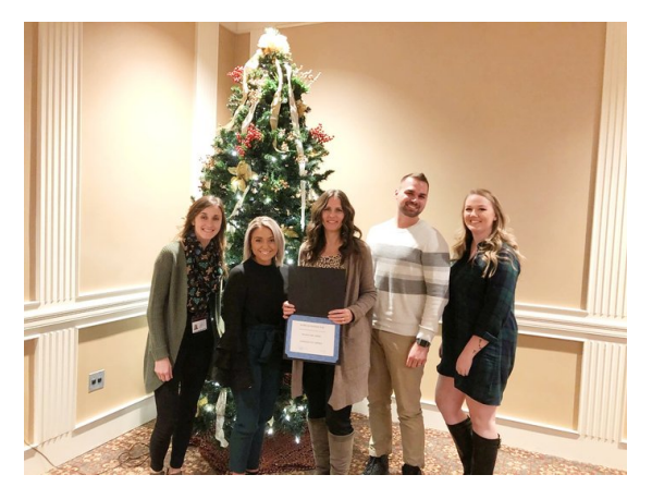
To find out what your local Power Up is up to here: www.PowerUpEatRight.com

For more tip on getting the family energized check out www.PowerUpEatRight.com/energizers